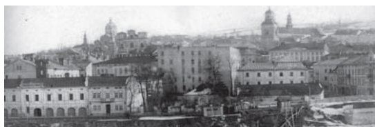
Gizowski house, 19th century