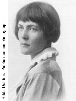
Hilda Dolittle.

1930 in which she played a part, disguised by the pseudonym Helga Doorn. She collaborated on the film with Hanns Sachs, whom Freud had reproached for his role in making the 1926 G. W. Pabst film, Secrets of a Soul .